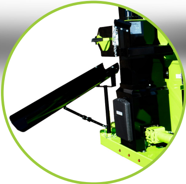
Standard Heated Off-Set Material Chute