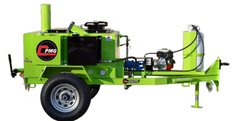
K-Series Emulsion Applicator