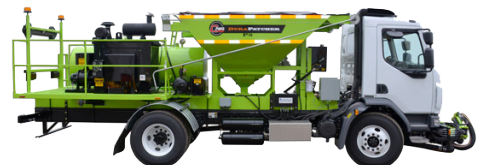
P-5 Dura Patcher

Due to continuous improvement, specifications are subject to change without notice.