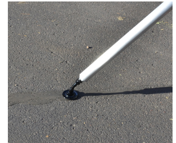
Electric Heated Wand Option