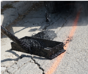
Standard Applicator Box