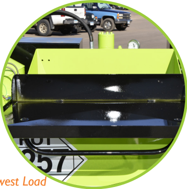
Lowest Load Height Largest Door