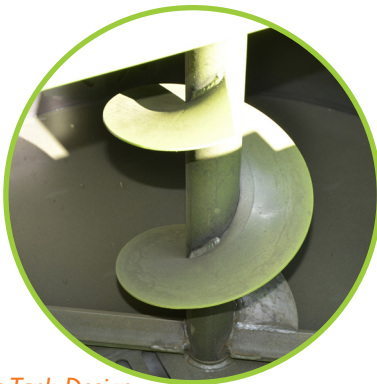
Performance Tank Design