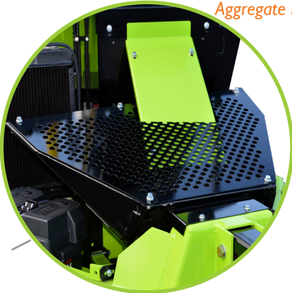
Aggregate Feeding System