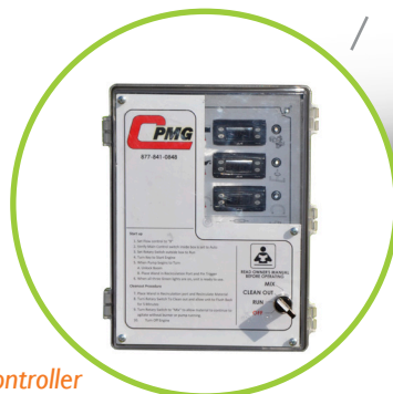
Simple Seal Controller