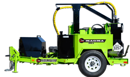
M-Series Crack Sealers