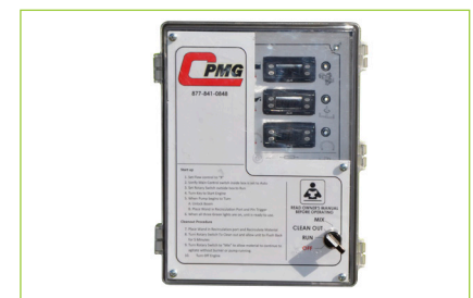
Simple seal controller