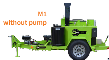
M1 without pump