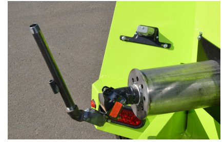
Optional heated draw-off option