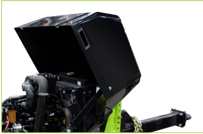
Optional engine cover