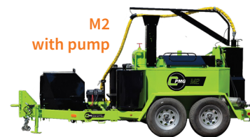
M2 with pump