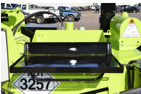
Lowest Height Largest Door