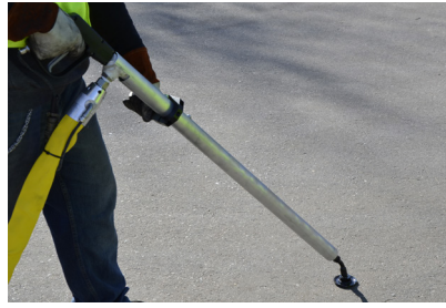
Electric heated wand option