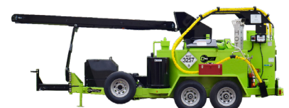
M4 dual hose, dual pump and conveyor