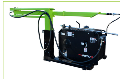
Optional X2, Carry-On Air Compressor