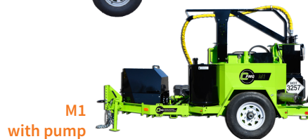
M1 with pump